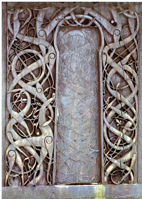
Ex. 5 – Door carving at Urnes stave church

The dominant role that the two intertwining strands introduced in “Det Syng” will have in Haugtussa as a whole is, in fact, summarized in the opening vocal phrase, which unfolds as an ascending minor arpeggio – the main melodic motive of the cycle as a whole – and a rising half-step (which in turn initiates another arpeggio; Ex. 6).